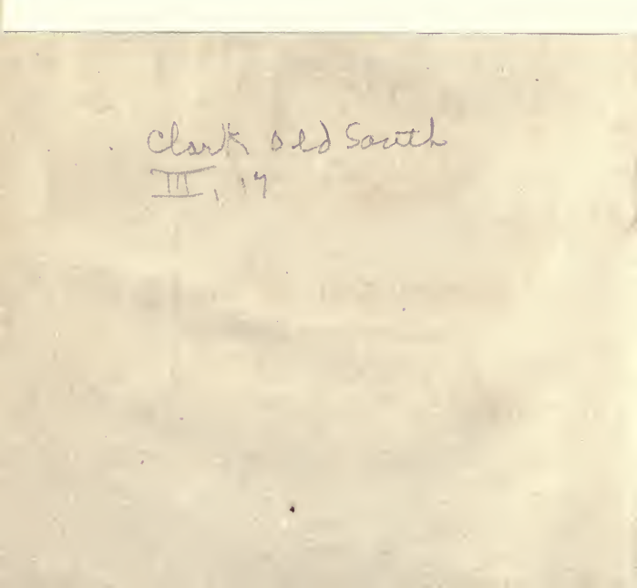
University of California • Berkeley